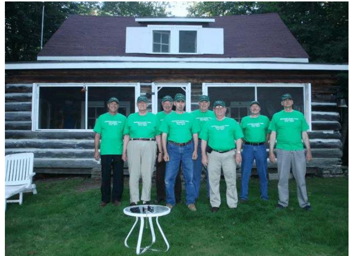
Centennial hats & T-shirts.