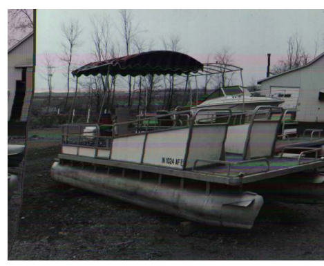
23' Crestliner purchased used in 1999.

All the bat houses have been installed and they seem to be working well. There were no bats in the 2<sup>nd</sup> floor of the Main Lodge where I sleep this year.