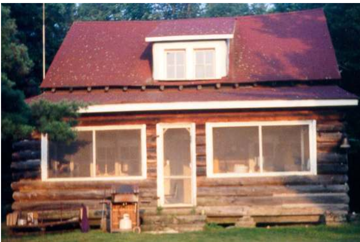
Re-chinking Picture July 1995.