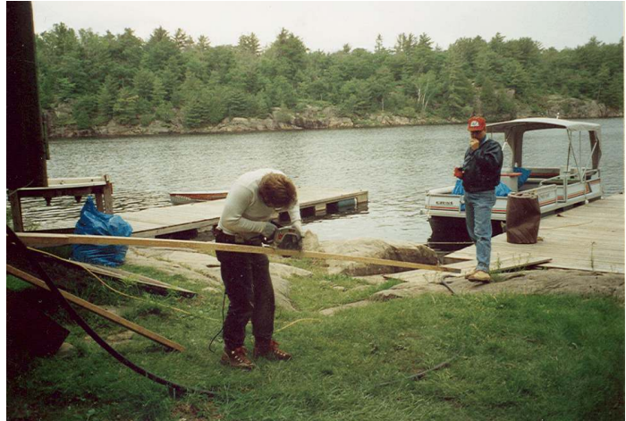
June 1994. Start of shower building.