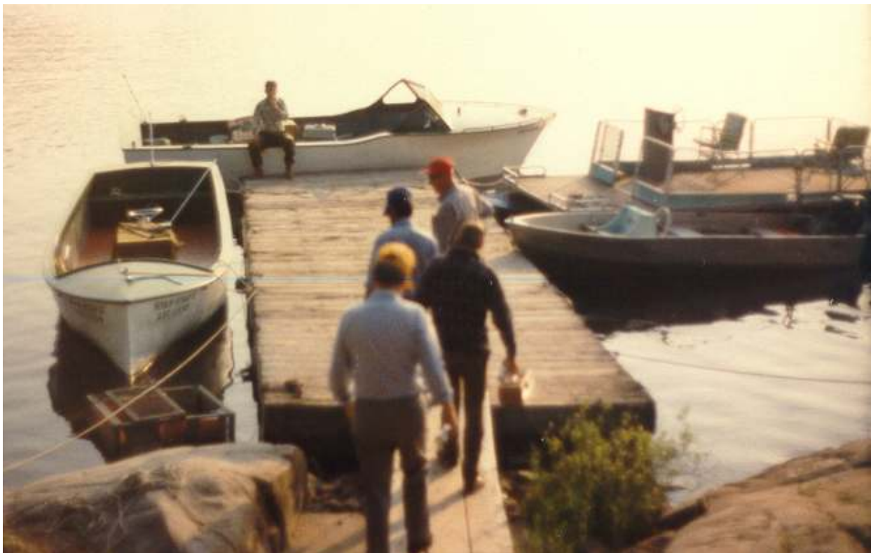
Camp Armada. Left - Hyah-Hyah. Top - Pappy Earl. Right Top - Party Boat. Bottom Right - FBI.

Replacement of the old decayed logs at the back of the Main Lodge was still underway and Al