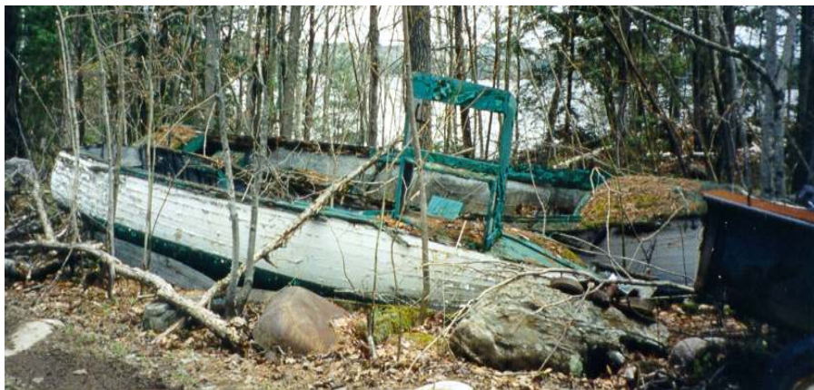
Betty Lou & Hyah-Hyah hulls.