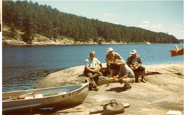
What a great picture. Shore lunch down river with plenty of sun and great friends.