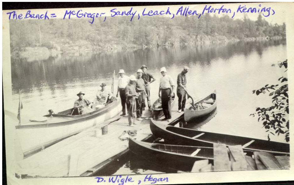
The Hyah-Hyah I. 28' wooden launch built in 1923.