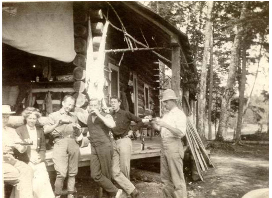
Celebrating a job well done. 1912.

This years work project was the completion of the sleeping porch attached to the south side of the main lodge and a small boathouse near the bay, south of the main lodge. The sleeping porch was a lean to type of construction with canvas walls like a large tent. The canvas had been salvaged from the sails of the "Fusilier". The area on the main lodge where the lean to was attached has since been covered by the siding but can be seen on close inspection.