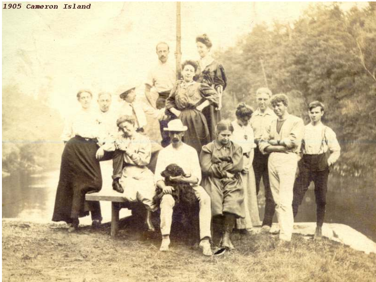
1905 Cameron Island