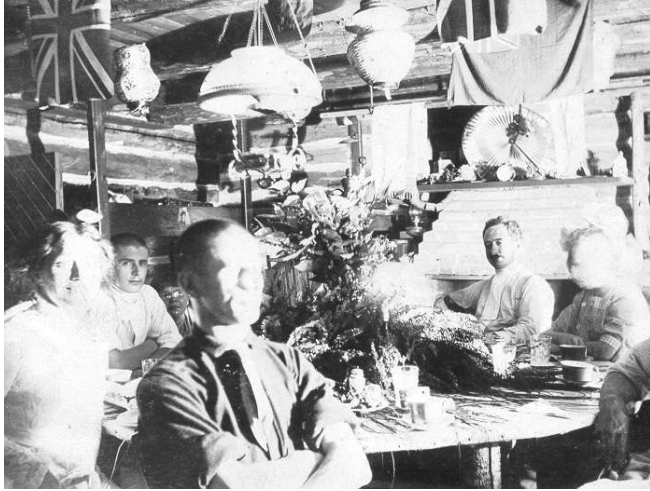
Cameron Island Lodge 1905.