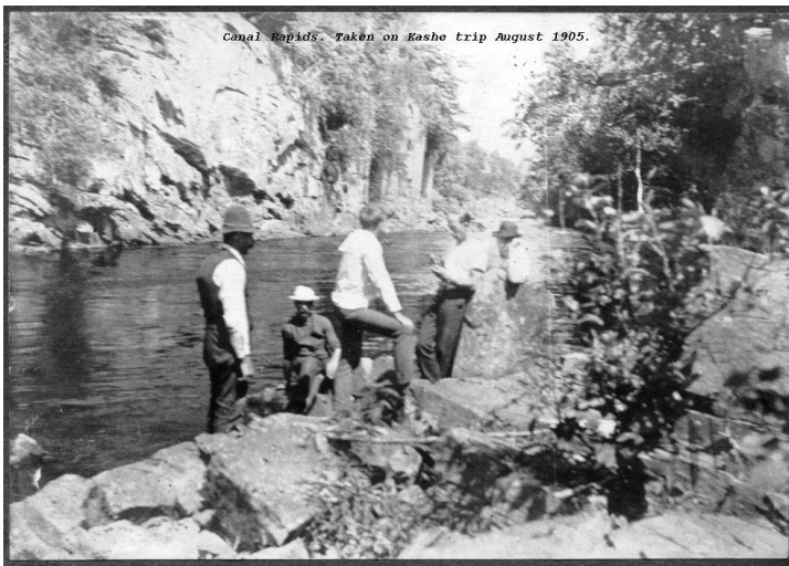
Canal Rapids Taken on Kashe trip August 1905.