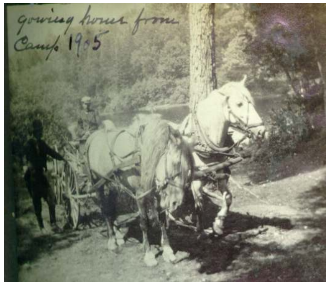
going home from Camp 1905